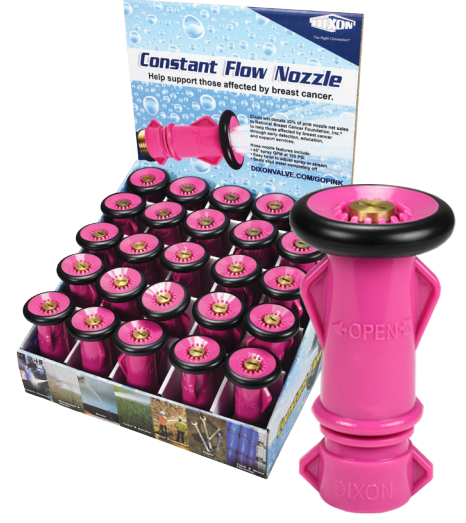
Special Edition Pink Constant Flow Nozzles pg. 11