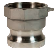
316 stainless steel