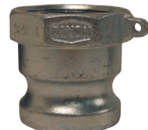
plated malleable iron