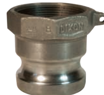
unplated malleable iron