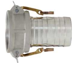
A380 permanent mold aluminum