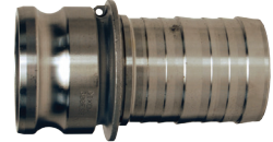
316 stainless steel