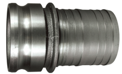
unplated ductile iron