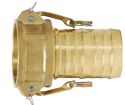
C38000 forged brass