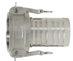
316 investment cast stainless