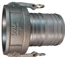
unplated ductile iron