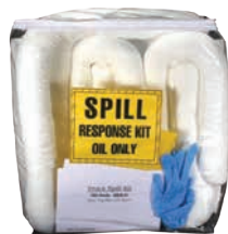
oil spill kit