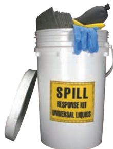
universal spill kit