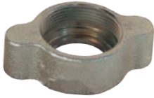
plated iron / steel