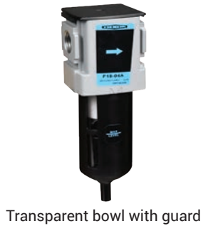
Transparent bowl with guard