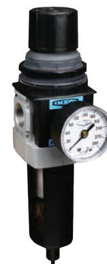
with transparent bowl

NOTE: See pages 312 - 316 for accessories. SCFM ratings at 100 PSIG inlet pressure.