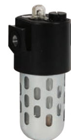
transparent bowl with guard

FRLs are designed for air service only, unless otherwise indicated.